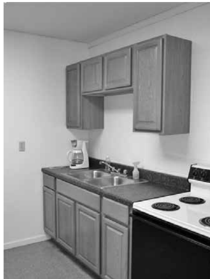
Room #2 - 6 upper & 6 lower