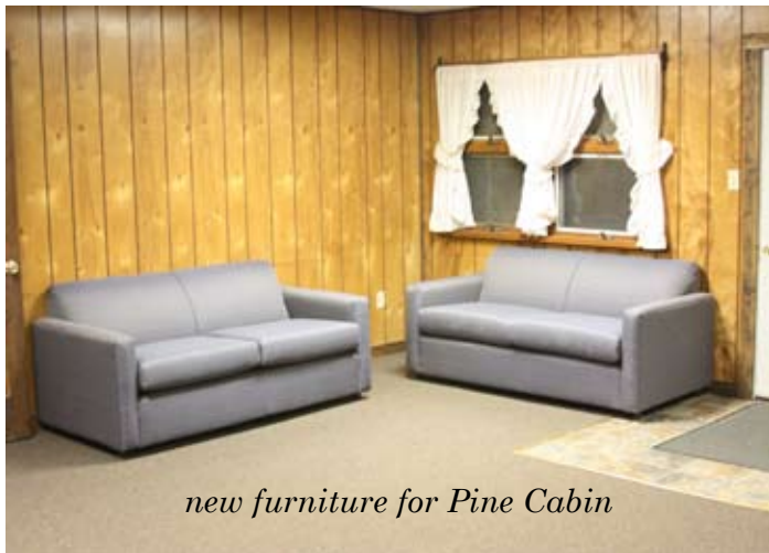
new furniture for Pine Cabin