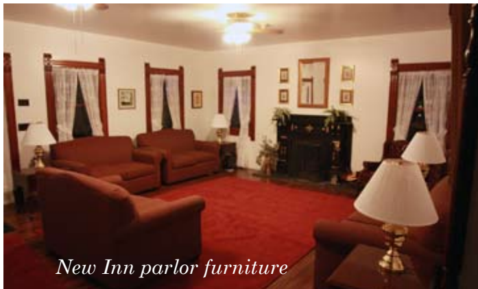
New Inn parlor furniture