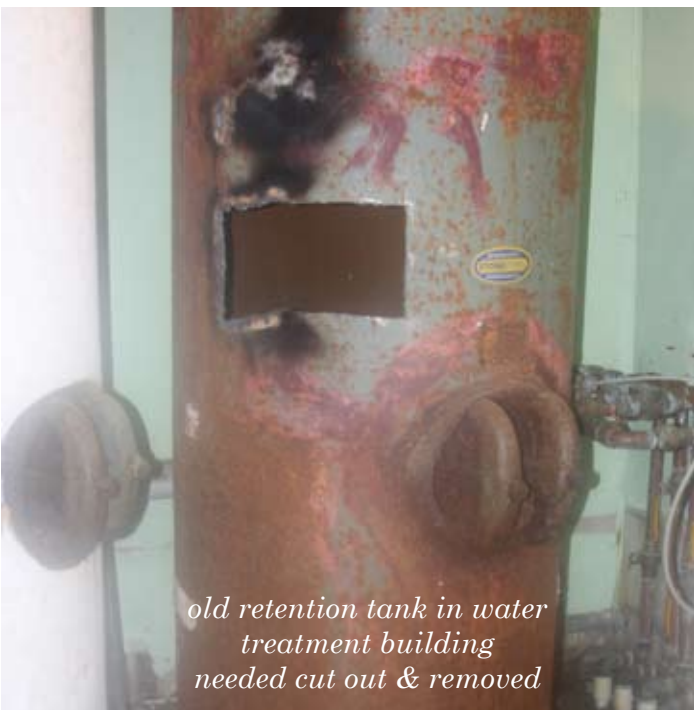
old retention tank in water treatment building needed cut out & removed