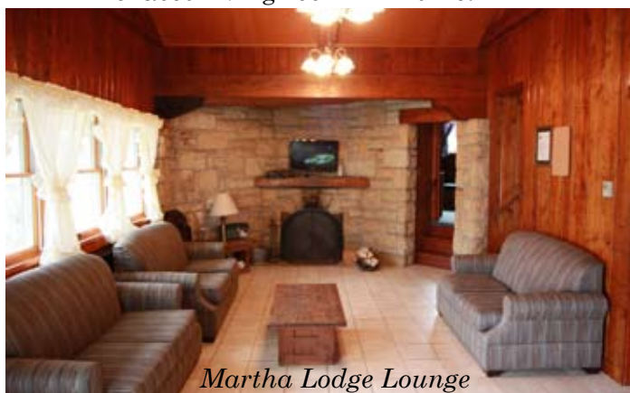
Martha Lodge Lounge