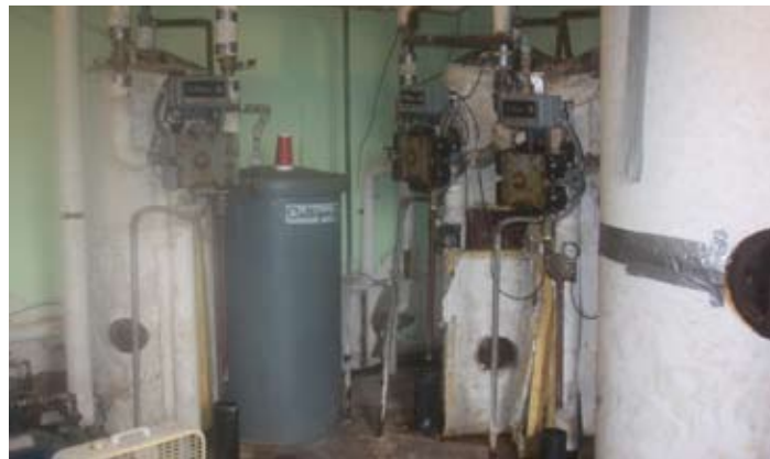
interior of water treatment building