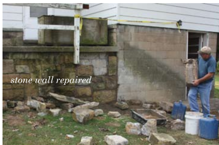
stone wall repaired