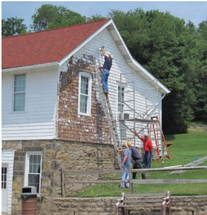
painting wooden section of Ann Murphy

A listing of the maintenance and capital improvement projects completed in 2011 were: