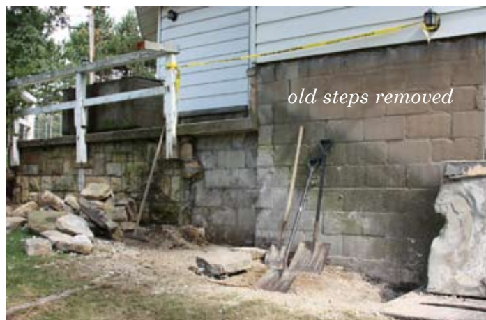
old steps removed