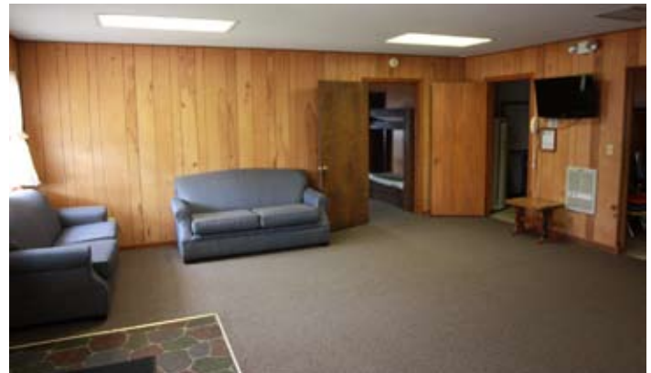
New furniture and LCD TV for Hickory Cabin