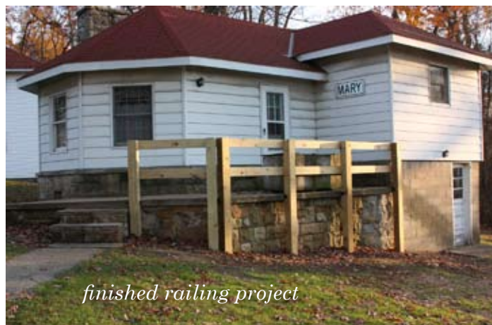
finished railing project